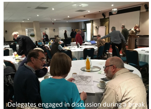
Delegates engaged in discussion during a break.

Given that we were in mid November, with very short daylight hours, planning a visit to a suitable site on Sunday afternoon was simply unrealistic, so instead we organised two full days of talks from an impressive programme of speakers (page 3).