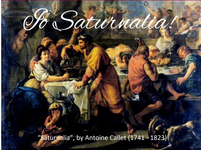
"Saturnalia", by Antoine Callet (1741 - 1823)

MILLE·VIAE·DUCUNT·HOMINES·PER·SECU·LA·ROMAM